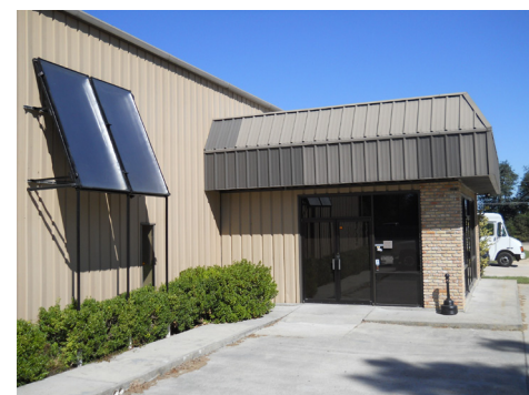
Solar Energy Services, located in Folsom, participated in the tour and was one of this year's 2010 Fall Solar Homes Tour Sponsors.

Also, if you missed the Fall Solar Homes Tour, there's no need to worry. LSES will hold its own solar homes tour in the spring of 2011. The date is yet to be announced, but stay updated by checking our website. All details for those wishing to place their home or business on the spring tour and for those who would like to attend will be sent out after Christmas.